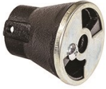
Press-On Air Mixer