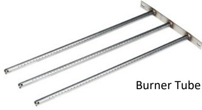
Burner Tube Assembly