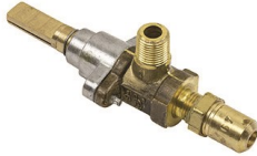
Control Valve with Orifice